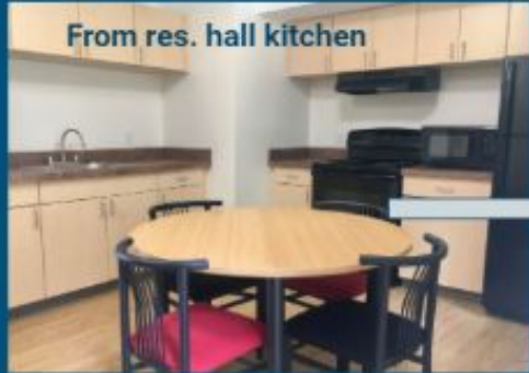
From res. hall kitchen