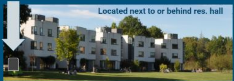
Located next to or behind res. hall

Don't know what to hold your compost in? Contact our office - we have plenty of options!